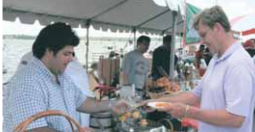
The Fabulous Food Court offers gourmet selections from local restaurants as well as popular festival food.