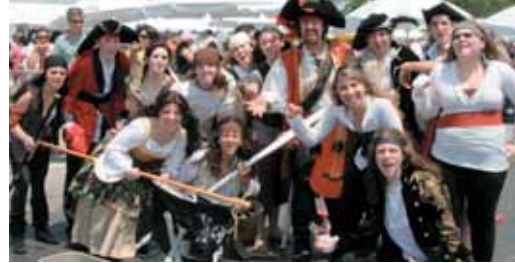
A troupe of maritime pirates provide swashbuckling entertainment for the whole family!

Sunday, June 7, from 10 am to 5 pm. HarborFest offers just plain fun for the whole family. Visitors may book a one-hour cruise on the tall ship SoundWaters, take a ride in the Port Washington Water Taxi, or go kayaking. There is a craft fair with over 93 vendors lining lower Main Street; free rides on the North Fork Trolley, a real Wells Fargo stage coach and the nautical singing group Stout. The Pride of Cow Bay Nautical Museum will unveil a new exhibit. Art in the Park will return, and many wonderful merchants will have booths on the dock. The Children's Fun Park has activ-