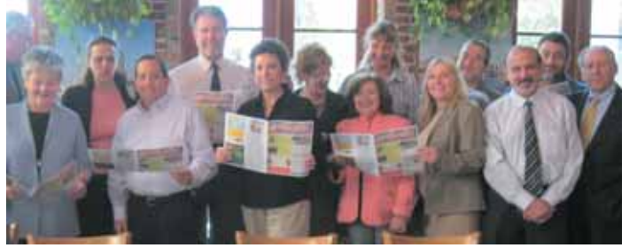
* May '09 Chamber of Commerce Meeting

Loyal readers of the Port Washington Calendar of Events always know just where to be in town!*