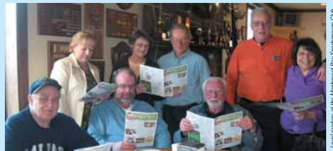
Loyal readers at the Manhasset Bay Sportsmen's Club