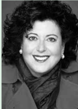
Author, Susan Isaacs