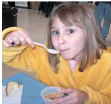
Try out delicious soups from local restaurants at Port Washington Chamber of Commerce's 4th annual SOUPer Bowl.

Many of our wonderful local restaurants and food establishments will be donating their best soups for the contest and hope to be voted Port Washington's 2011 SOUPer Bowl Champ. "Buy a Spoon" and become a "taster" to sample two ounces of each of the soups donated by the restaurants. Then vote for your favorite soups to determine the 2011 SOUPer Bowl