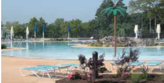
North Hempstead's newly-constructed Manorhaven Pool

The newly-rebuilt 25,000 square foot main pool area and 12,000 square foot bathhouse complex features event space and food services, a competi-