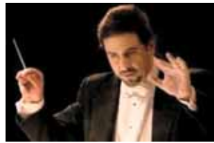
Conductor Anthony LaGruth

The Friends of the Sands Point Preserve present the North Shore Music Festival Opera: Pagliacci, September 17, at 7pm in the historic Hempstead House on the Guggenheim Estate. The evening starts with a pre-concert light dinner paired with select wines. Guests may tour the newly renovated Guggenheim Gardens and meet the acclaimed artists performing in the operas. The concert featuring world-class opera singers begins at 8 pm in the Palm Court "piazza," with dessert at 9:30 pm.