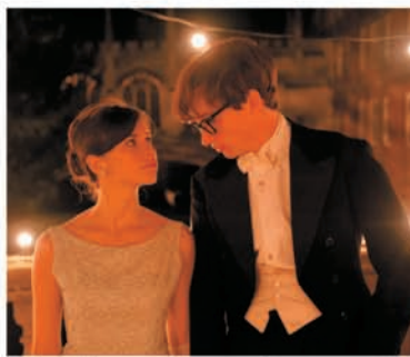
The Theory of Everything, starring Eddie Redmayne, winner of the Academy Award for Best Actor, will be shown Monday September 21 at 7:30 pm.