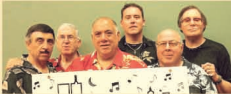
New York Exceptions Doo Wop Band, Music from the '50s & '60s.

Sunset Park. For info call 708-5819. In the event of rain at concert time the concert will be cancelled.