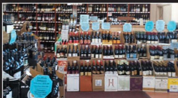
4000 Sq. Ft. stocked sales floor