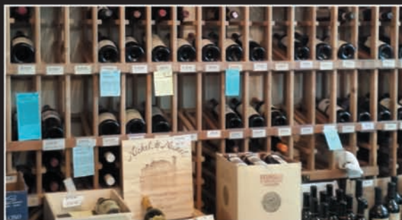
Visit our temperature controlled fine wine closet

We BEAT or MATCH Any Advertised Price In Nassau County (MUST BRING IN COMPETITIVE AD)