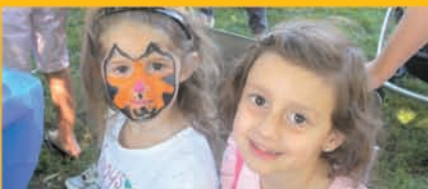
Full story on page 2!